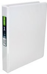
Pen + Gear Basic Round Ring View Binder, 1", White