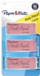
Paper Mate Pink Pearl Erasers, Large, 3 Count